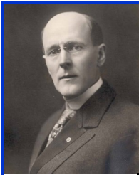
Paul Harris Founder of Rotary